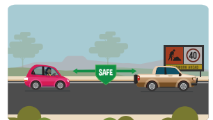
Maintain a safe distance