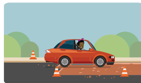
Expect the unexpected