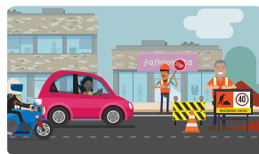
Watch for the signs